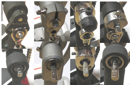
Arm On Top View. Arm Off Bottom View.

The Quick Torque Cam will replace the spring arm on your pedal. The spring arm is used to adjust the beater stroke, and pull the spring. What ever brand pedal you may have, all spring arms attach with a set screw(s) to the drive shaft in the same way.